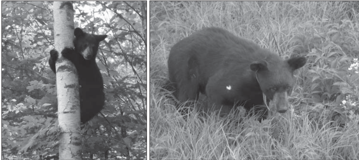
Figure 2. Black bear cub at rehabilitation facility (left) and GPS radio collared yearling during release (right).

dropped off were collected from the field; those failing to release were retrieved via winter den visits. Ground and aerial telemetry locations, though limited, were used for analysis when a collar was irretrievable. Location data were downloaded from recovered collars and screened for accuracy by removing locations with dilution of precision (DOP) >5 (Lewis et al. 2007). Screened locations (for retrieved collars) and telemetry locations (for irretrievable collars) were then plotted and analyzed in ArcMap 10 (Environmental Systems Research Institute, Redlands, CA, USA).